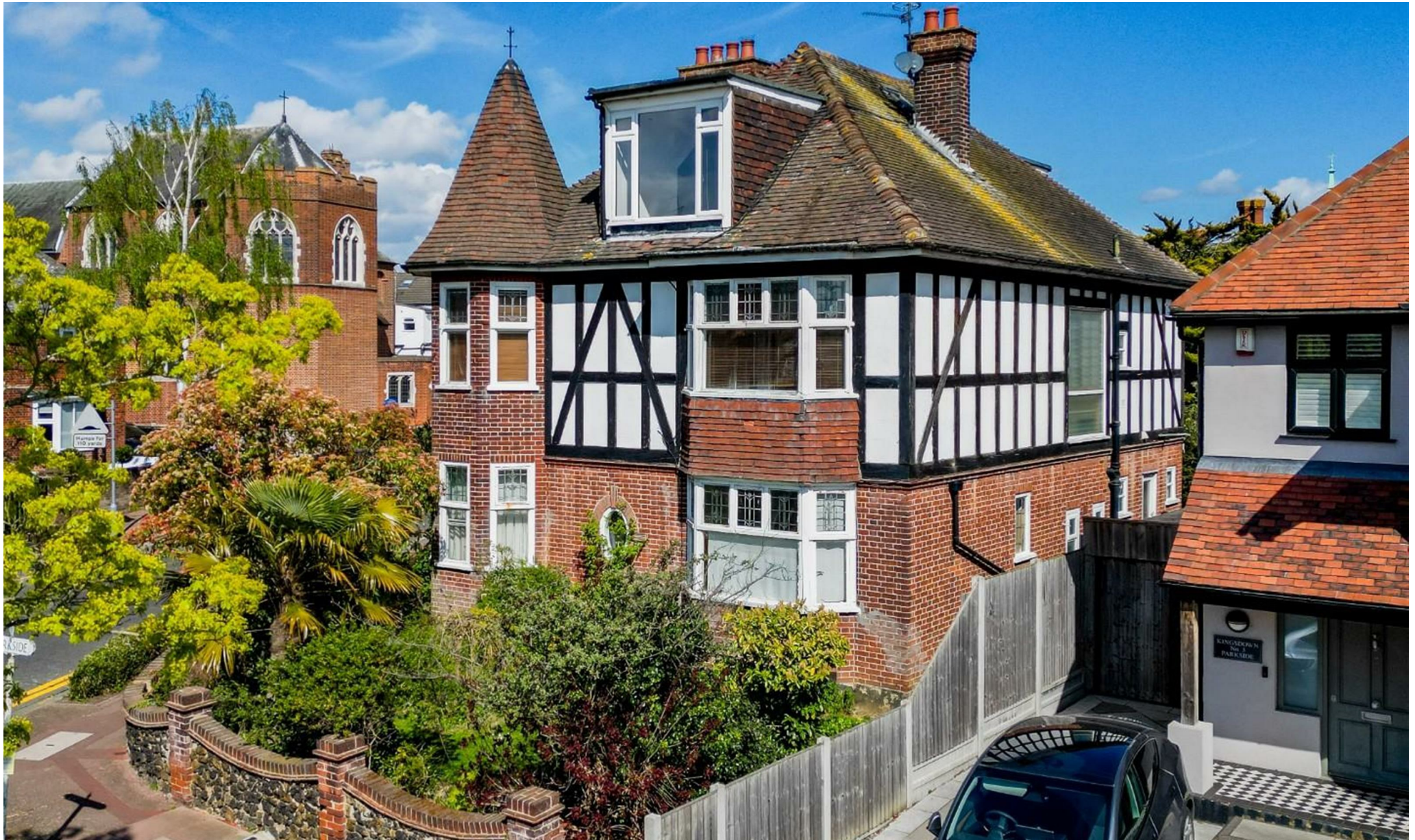
Mount Avenue, Westcliff-On-Sea £1,000,000